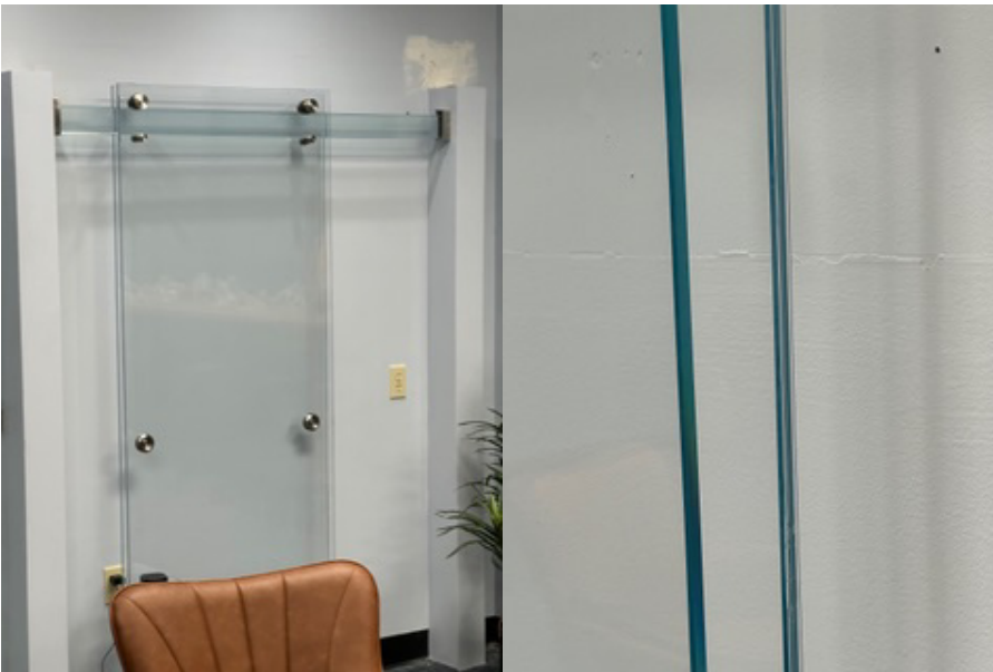
3/8" Low Iron Glass: Notice Optical Clarity Notice Blue Edge (Not Clear)

Expectations: Low Iron reduces iron content which reduces, but does not eliminate, green/blue hue.