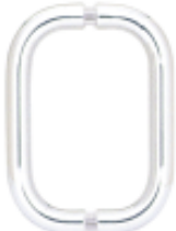
Deluxe Solid Back To Back 1" Diameter Handles