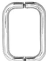
Standard Tubular Back to Back 1" Diameter Handles