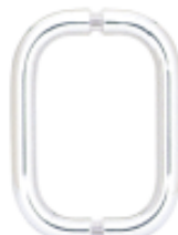
Deluxe Solid Back To Back Handles