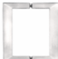
Square Style Back To Back Handles