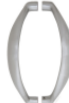
Ergonomic Style Back To Back Handles