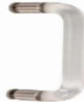
Acrylic Single Mount Handles