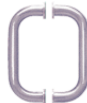
Standard Tubular Back To Back Handles w/Washers