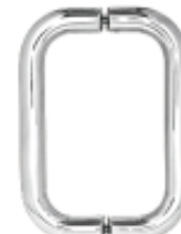
Standard Tubular Back To Back Handles