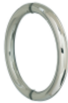
Circular Back to Back Handles