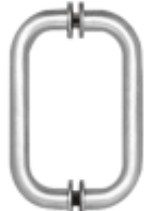
Deluxe Solid Back To Back Handles w/Washers