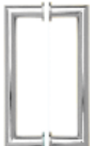
Mitered Style Back to Back Handles w/Washers